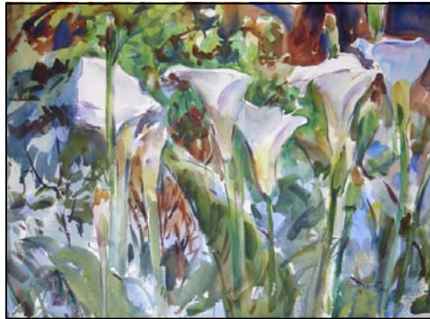
Calla Lillies II 22x30

This driving cause for my work has sustained me through nearly 30 years of painting with-