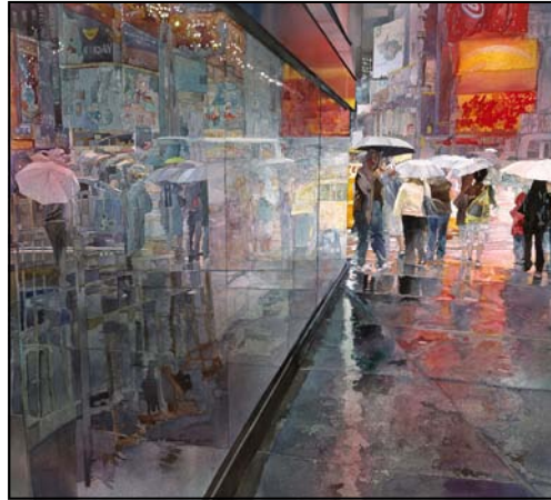
“Rainy Day Times Square”

I recently read a wonderful quote: "Value carries the load but color gets the credit". Through this understanding, I've learned to incorporate careful value decisions into each painting I do. Every time I go to a show or