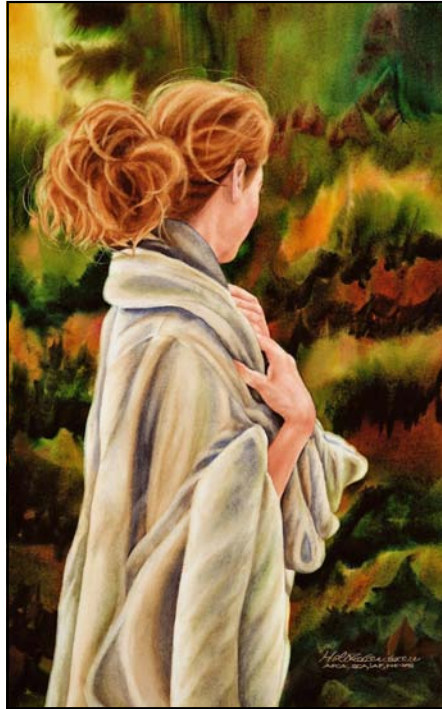
3rd Place- "A Different Turn" Helen-Louise Fallardeau